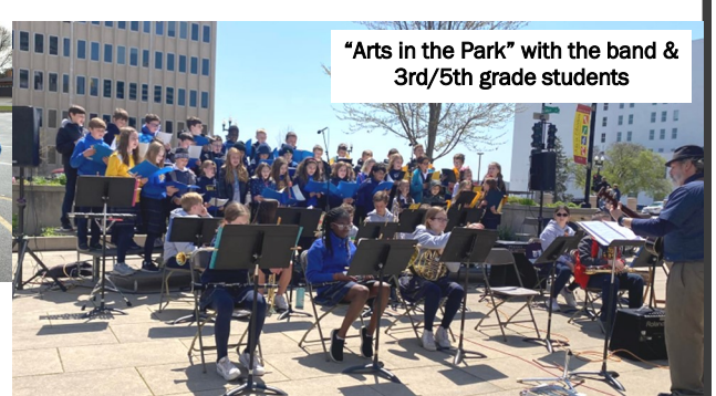
"Arts in the Park" with the band & 3rd/5th grade students