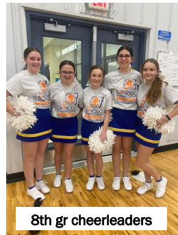
8th gr cheerleaders