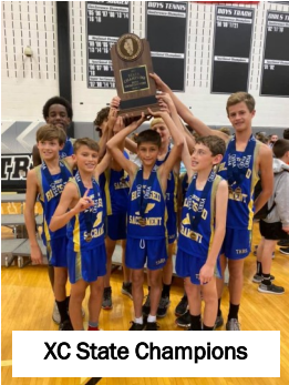
XC State Champions