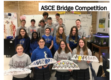
ASCE Bridge Competition