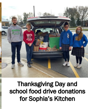
Thanksgiving Day and school food drive donations for Sophia's Kitchen