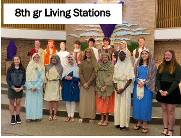
8th gr Living Stations