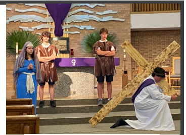
8th gr Living Stations