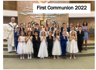
First Communion 2022