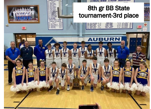
8th gr BB State tournament-3rd place