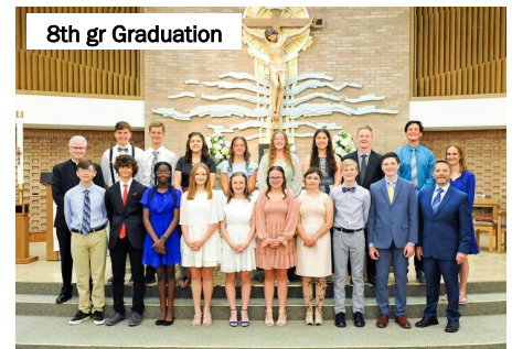
8th gr Graduation