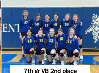
7th gr VB 2nd place Catholic Schools tourney